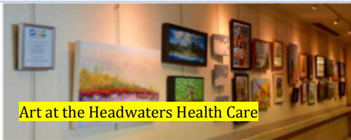
Art at the Headwaters Health Care