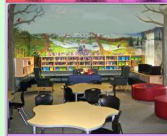
The Riverbend Artists of Grand Valley in collaboration with the Laurelwoods Elementary School Community