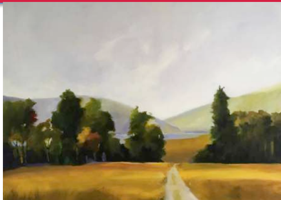
John Adams Interpretive Landscapes

Headwaters Arts Gallery http://headwatersarts.com