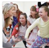
ARTISTS IN THE SCHOOLS