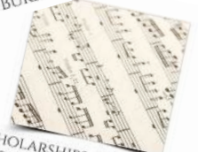
SCHOLARSHIPS, BURSARIES & GRANTING PROGRAMS