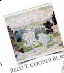
REED T. COOPER BURSARY