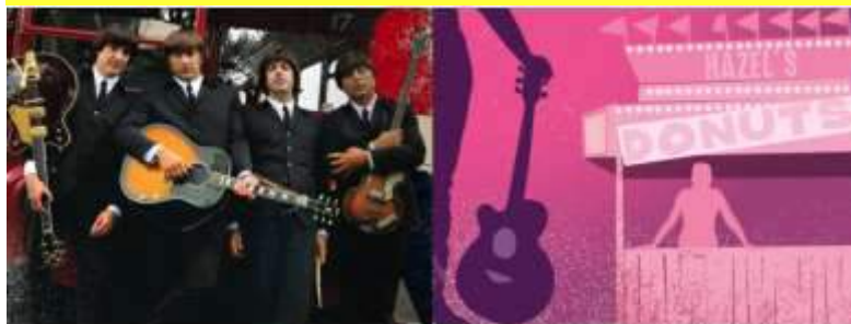
The Caverners Back by popular demand!

Headwaters Arts HA Dam Gallery http://headwatersarts.com